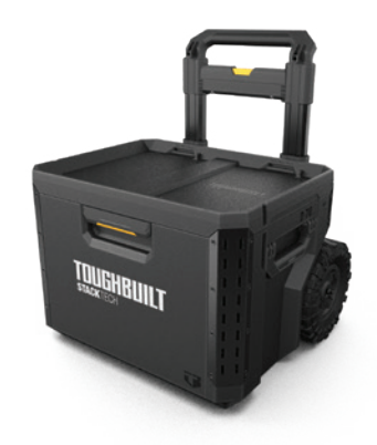
ROLLING DRAWER BOX