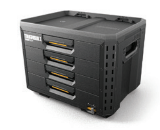
XL 4-DRAWER TOOL BOX