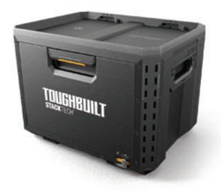
XL 1-DRAWER TOOL BOX