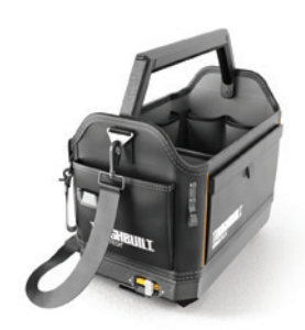
TOOL TOTE 30 X 45 X 35 CM TB-B1-S-80C