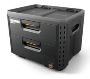
XL 2-DRAWER TOOL BOX