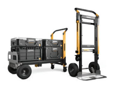
2-IN-1 CONVERTIBLE HAND TRUCK TB-B1-T-20