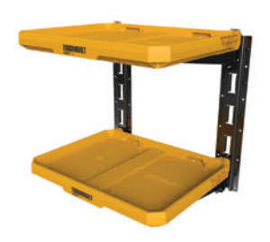
2-SHELF SYSTEM 53 X 42 X 52 CM TB-B1S3-M-20