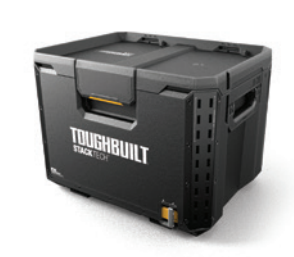
XL TOOL BOX 53 X 41 X 39.5 CM TB-B1-B-70