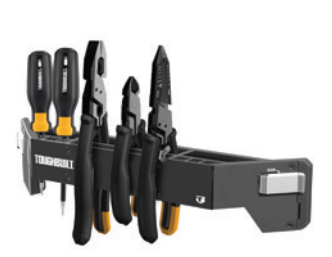
HAND TOOL BAR