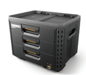
XL 3-DRAWER TOOL BOX 53 X 41 X 39 CM TB-B1-D-70-3