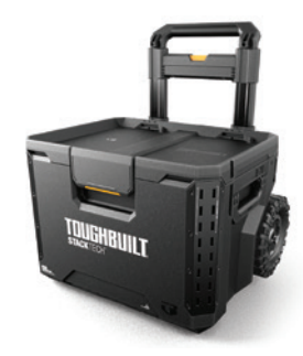
ROLLING TOOL BOX 56 X 50 X 66.5 CM TB-B1-B-70R